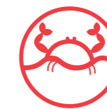
Species introduction and invasive species

Habitats and species associated with seamounts, underwater caves and canyons, aphotic hard beds and chemo-synthetic phenomena