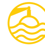
Specially Protected Areas

Listed in Annex II of the Protocol concerning Specially Protected Areas and Biological Diversity in the Mediterranean