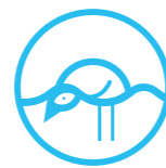
Marine and coastal bird species

Listed in Annex II of the Protocol concerning Specially Protected Areas and Biological Diversity in the Mediterranean