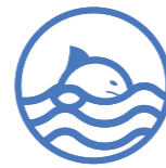
Cartilaginous fishes (Chondrichthyans)