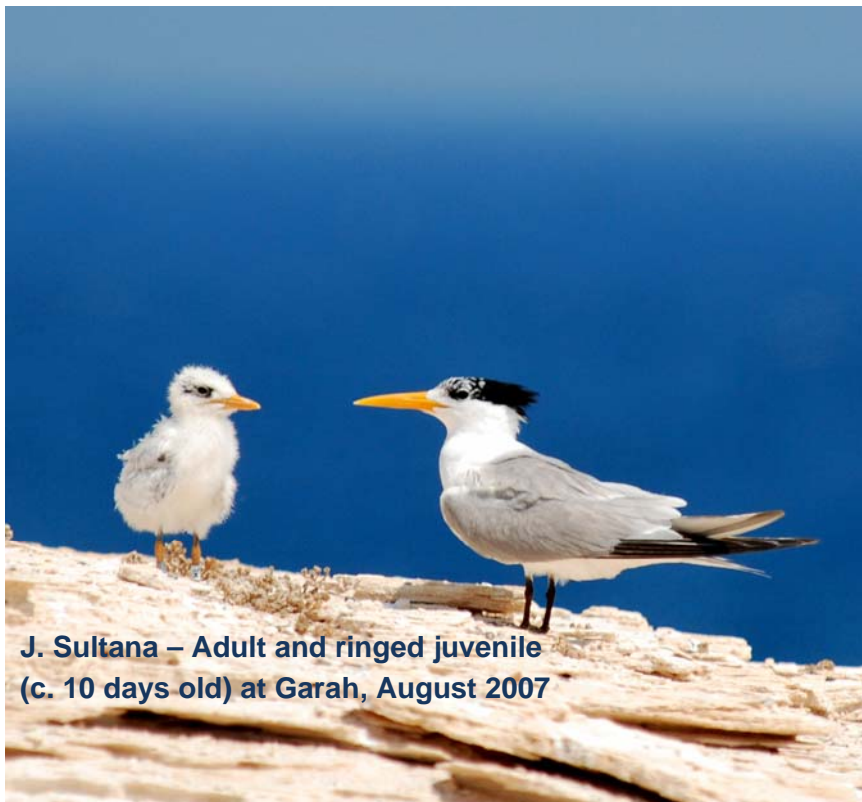
J. Sultana – Adult and ringed juvenile (c. 10 days old) at Garah, August 2007

Colour rings with inscribed alphanumeric codes must be made of special acrylic material, very strong, UV-resistant and unaffected by temperature changes. The best material so far available, used in Libya since the start of activities, is PMMA (poly-methyl-methacrylate). Engravings on the rings must be neat, so that codes can be read without confusion even from the distance. Letters and numbers forming the codes must be chosen as to reduce confusion (e.g. choose between pair of similar letters: P and R, O and zero, G and C...). Codes only composed by letters which can be read either upwards and downwards (e.g. O, H, N, S, Z, X...) should be discarded. It should be preliminarily checked that the chosen codes allow enough rings to be produced to cover the whole study requirements. It is always convenient alternating code orientation (up or down) during usage.