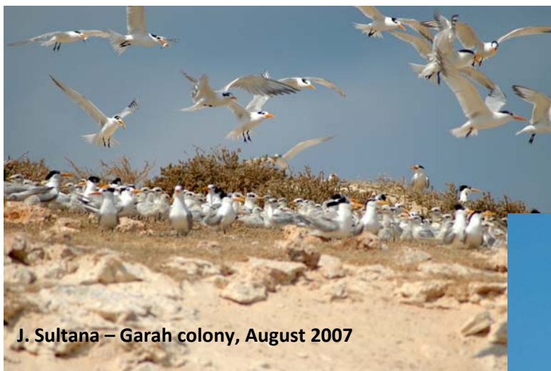
J. Sultana – Garah colony, August 2007

5) Ring monitoring – Ring-reading on breeding adults and unfledged chicks can hardly be performed on the colony of Garah, and – if attempted - will likely impact to a large extent the local breeding population. As a rule, it should be avoided here. Rings on individuals roosting on nearby rocks can be approached and read with no problems. Detailed ring-reading methods are described for Ulbah island.