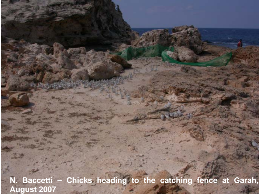
N. Baccetti – Chicks heading to the catching fence at Garah, August 2007

Timing. Every second year. The ideal date for the colony size assessment should fall at the end of the incubation period, but before the earliest chicks have hatched. This condition will be found at Garah around 15 July. An earlier survey, as described in point 1), could help choosing the date more precisely and accounting for year to year variation. The colony should be approached in the early morning hours, no later than 9 a.m., with an air temperature lower than 32°C. Keeping adults in flight later in the day (when the sun is higher above horizon and temperature is higher too) would cause a mass death of the egg embryos in a much shorter time than the suggested 15 minutes.