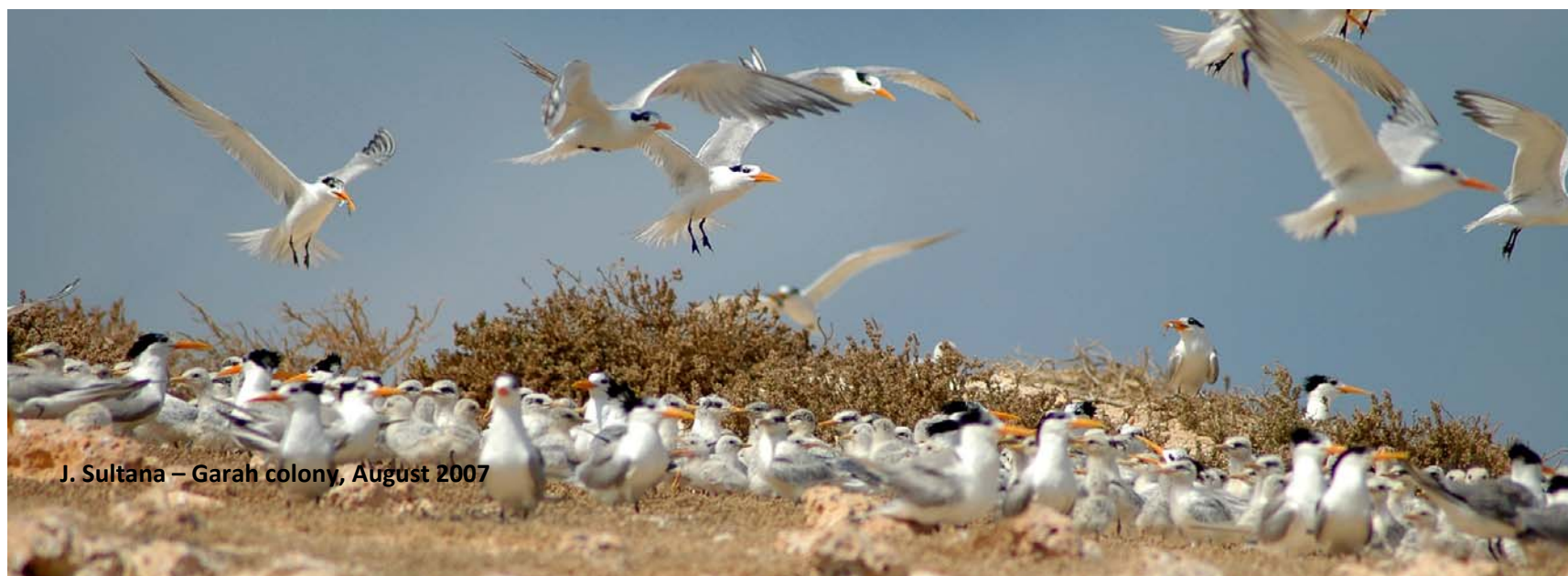
Table 1 - Suggested actions at the known breeding sites.