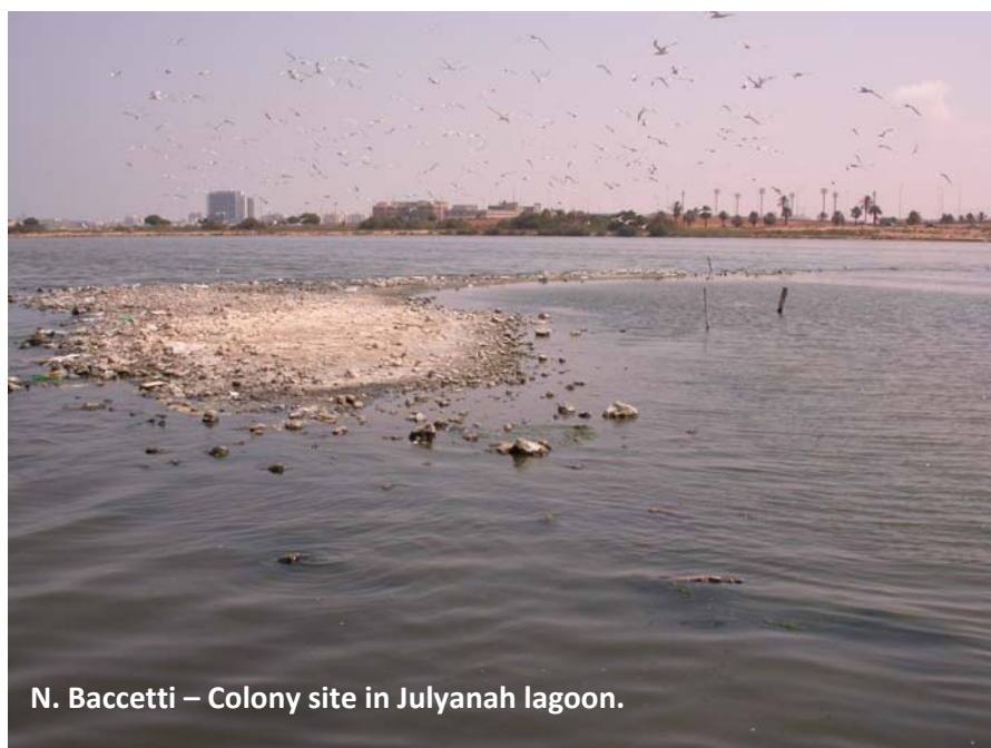
N. Baccetti – Colony site in Julyanah lagoon.

1) Surveys from vessel – This survey must not be performed here (must be avoided). The colony lies on a small islet (enlarged in April 2012) inside the Julyanah lake, which can be fully checked from the border of the lake. Since 2012 terns also breed at a former peninsula on the western shore, isolated from the mainland by a narrow channel. Telescope observations (same as in point 5: Ring monitoring) must replace this action.