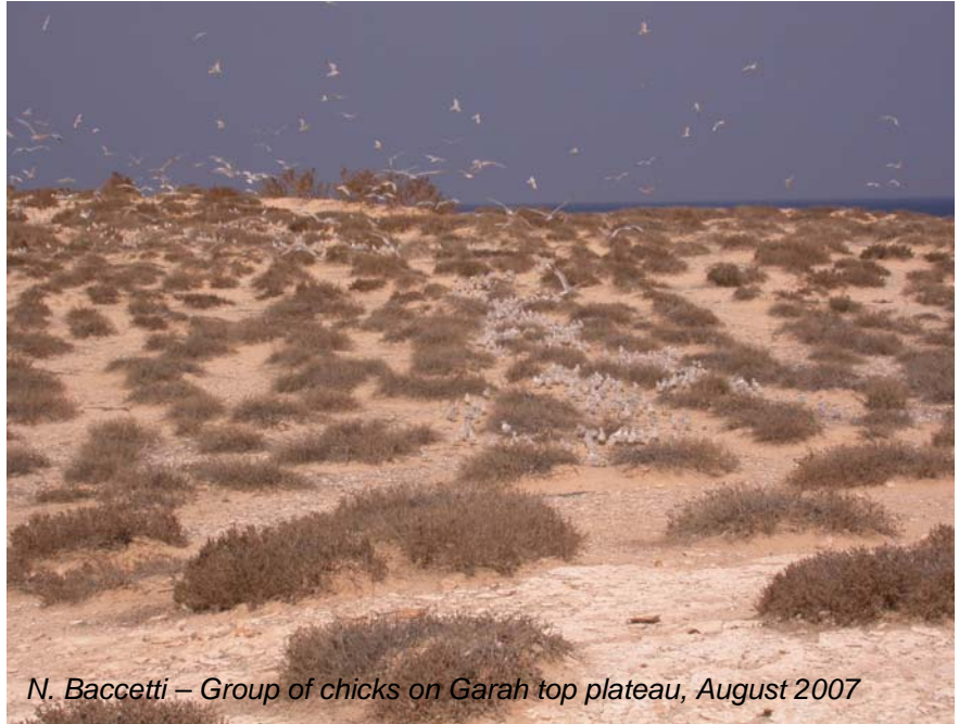
N. Baccetti – Group of chicks on Garah top plateau, August 2007

Action A) Team of two operators plus one secretary, to determine the colony position, shape and size, as well as the nest density. The secretary takes a good GPS position (waypoint) from the edge of the colony and roughly draws on paper the shape of the area where nests are present; the operators measure the orthogonal diameters of the nesting area (at least two, but it depends on its shape), which the secretary notes on the map using identification letters as appropriate. Done this, the operators gently place the pipe frame on the