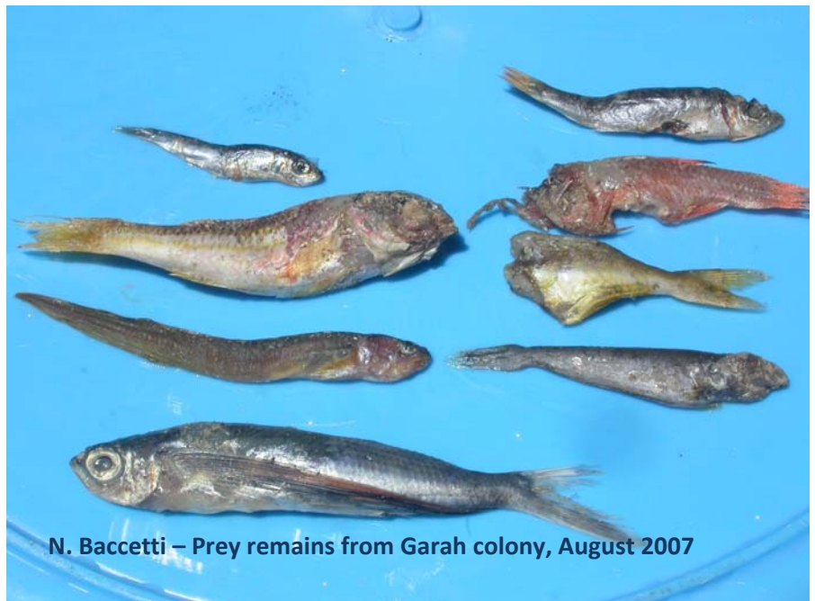
N. Baccetti – Prey remains from Garah colony, August 2007

Timing. The visit must be performed in the early morning hours, to reduce the risks of overheating of chicks. Since chicks must be large enough to bear rings and run easily, under normal conditions ringing should take place around 10 August.