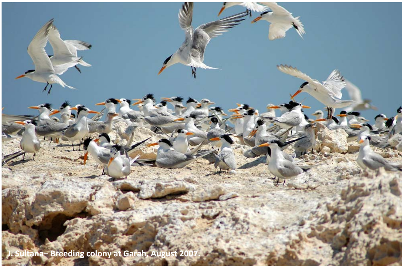
J. Sultana– Breeding colony at Garah, August 2007.

For small colonies (up to 50 pairs), such as those at Bumbah, a visit by 1-2 people will allow a direct nest count with less than 5 minutes of disturbance for the adults (count and note first all nests with 2 eggs, then those with one, and eventually the empty nests). Colonies around 100-200 pairs can be best counted using one or two photos, without the need of ropes. Larger colonies require a more composite method, as described below for Garah.