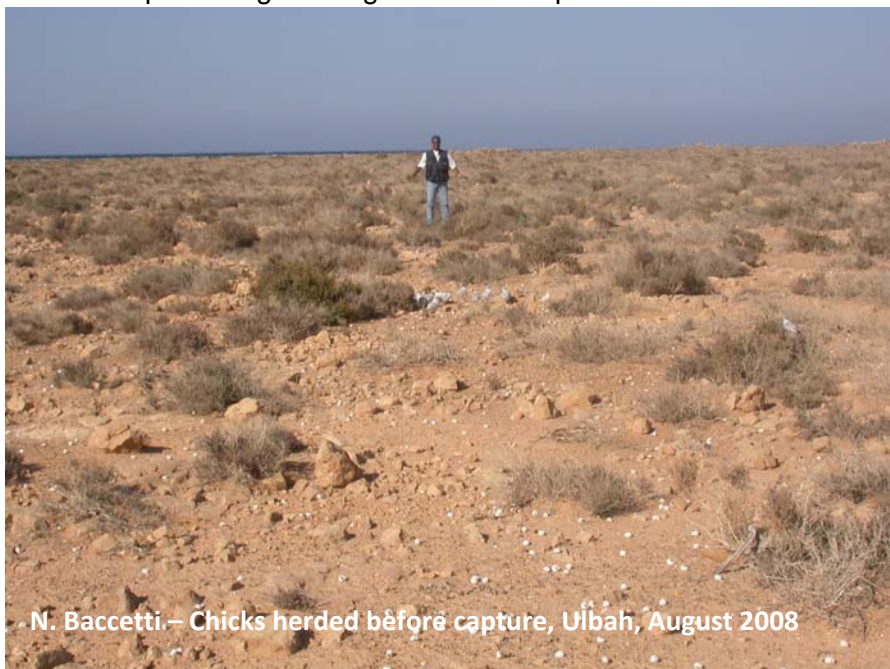
N. Baccetti – Chicks herded before capture, Ulbah, August 2008

Methods. Same as at Garah; thick cardboard boxes might be necessary to keep/transfer small numbers of chicks.