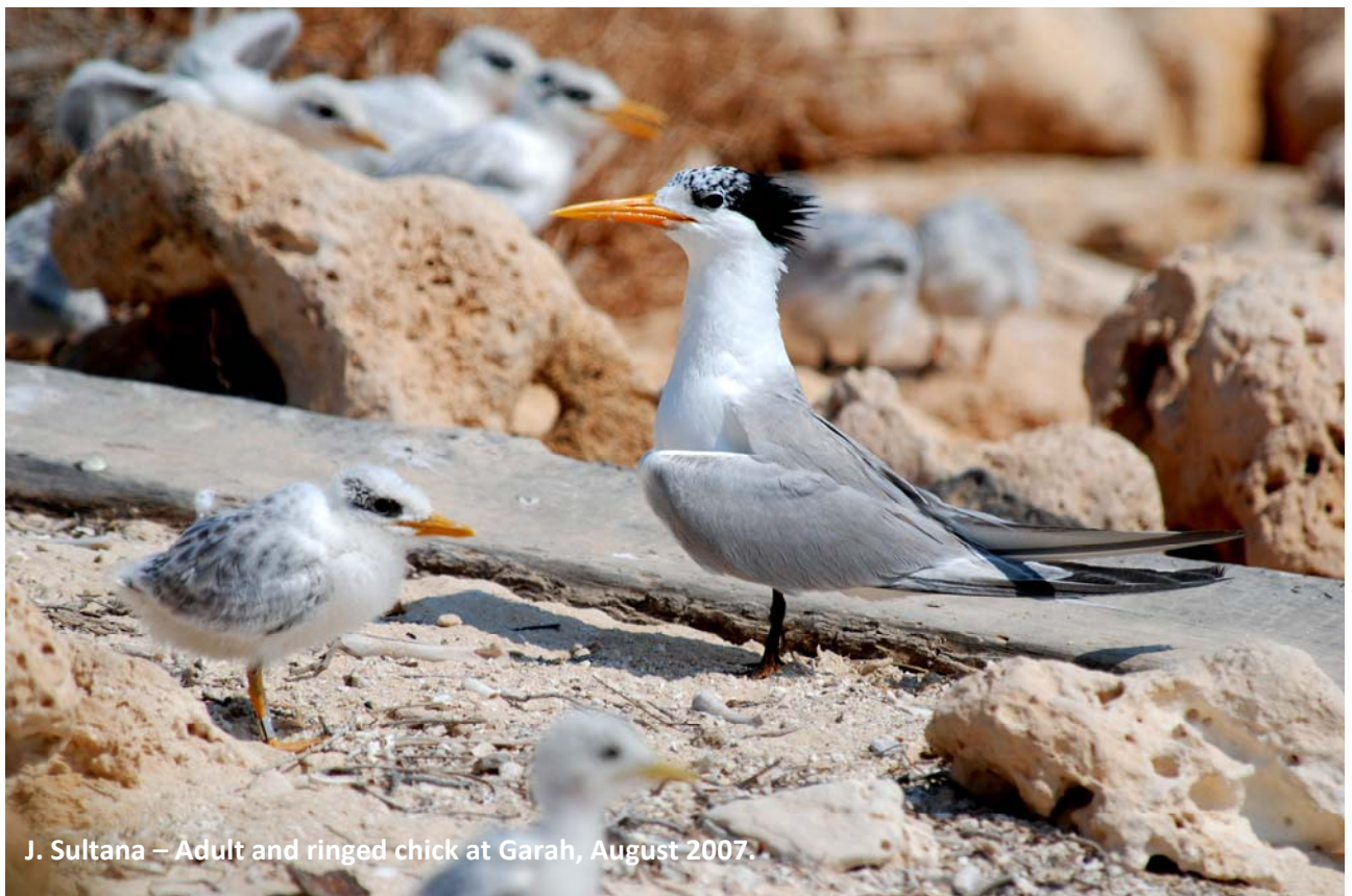
J. Sultana – Adult and ringed chick at Garah, August 2007.

Timing. The visit must be performed in the early morning hours, to increase visibility and reading of rings. Given the favourable location of this colony, several visits should be planned along the breeding season.