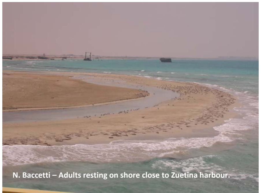
N. Baccetti – Adults resting on shore close to Zuetina harbour.

Timing. The visit must be performed in the early morning hours, to increase visibility and reading of rings and to reduce heat stress to eggs/chicks if adults temporarily move away from their nests.. Any hint of disturbance to the colony, especially when eggs or small chicks are present, should cause the interruption of the ring monitoring after 15-20 minutes. If availability of boats and people allows, several visits could be planned at various stages of the breeding season.